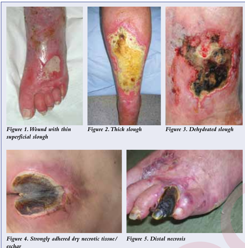
Figure 1. Wound with thin superficial slough