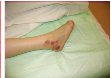
Rapid healing and good visibility on the wound through the Suprasorb® X-PHMB.

Painful heal flap injury, painless after application Suprasorb® X-PHMB 24-02-2009