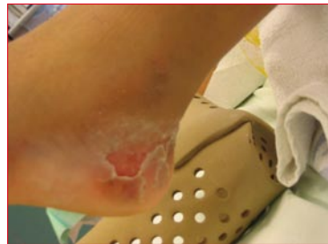
Healed within 5 days. 09-06-2008