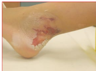
The Suprasorb® X PHMB dries out at the edge of the wound. 12-06-2008

Start with Suprasorb® X-PHMB after 24hr Flammazine. 09-06-2008