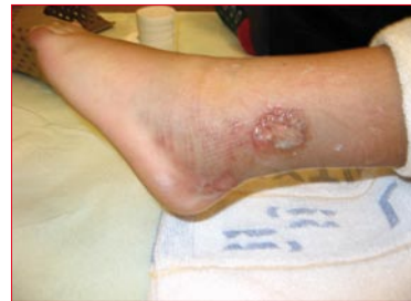
Application of Suprasorb® X-PHMB. The egde is drying out. 8-3-2009

A difficult to heal flap injury with infection and pain. 2-3-2009