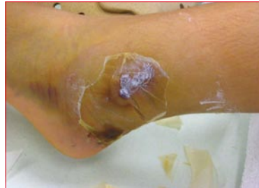
Suprasorb® X-PHMB came off the wound, full epithelisation. 18-06-2008